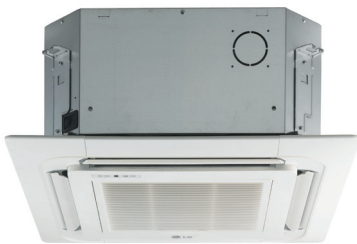
Multi F Ceiling Cassette Indoor Units