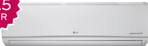
Standard High Efficiency Wall-Mounted Indoor Units