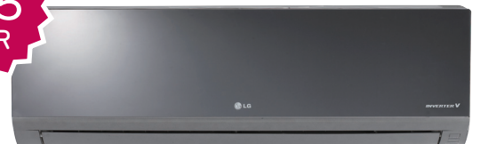
Art Cool™ Mirror High Efficiency Wall-Mounted Indoor Units