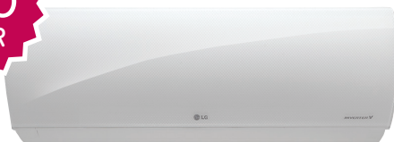
Art Cool™ Premier Supreme Efficiency Wall-Mounted Indoor Units