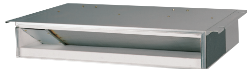
Multi F Ceiling Concealed Ducted Indoor Units